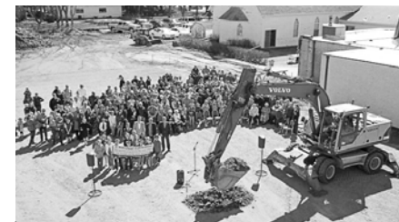
Salem Church celebrates groundbreaking for new CE wing.

After many years of praying, planning, giving and anticipation, all generations of our congregation came together on April 12 for “Milestone Sunday” to celebrate groundbreaking for the new Christian Education wing and multi-purpose room. Our theme was “Praising God for the Past — Praying for the Future.” The workmen have been going non-stop ever since; walls were up already by the end of May.