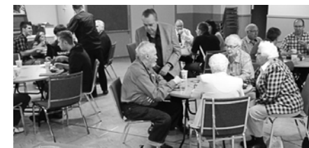
Muffin Breakfast at Christian Fellowship Chapel

A small group, including our pastor, meets weekly for CFC Prayer Time to pray for our small congregation. We come to prayer without our own agenda, wanting to hear what is on Jesus' heart, and pray for one solid hour. We read Scripture verses to inspire our praise, confession, and petitions. The presence of the Holy Spirit is tangibly sweet, and we hope that our small band becomes multiplied many times over. A recent prayer time found us asking the Lord to make us all intentional disciples of Jesus.