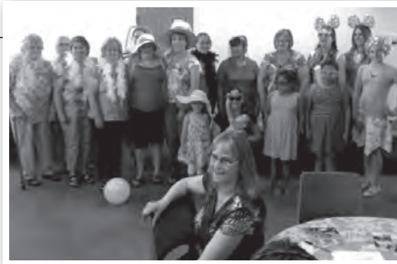
The "winners" from one of our games from the Mother Daughter tea in Vita. Each one was caught with a mystery gift and told to put on whatever the present may contain.

Teen Challenge visited us in May and shared inspiring testimonies of how God has transformed the lives of the men within its program. When we are brought low and realize just how much we have been forgiven, we can have so much appreciation for what God has done for us.