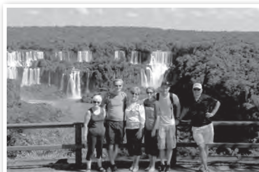
Grace EBC's Paraguay missions team

Focus on our Churches continued on Page 14