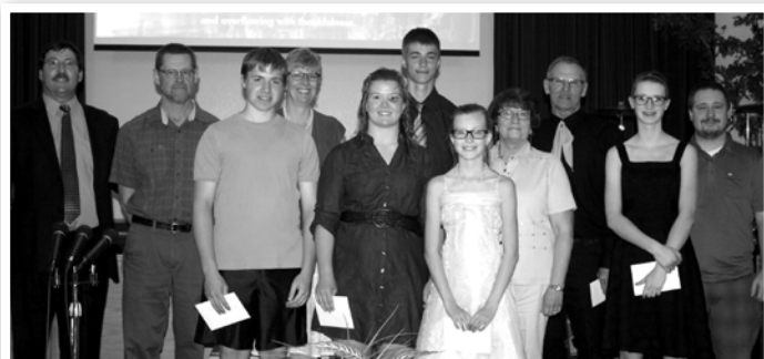
Langham EBC celebrated a baptism and membership service recently.