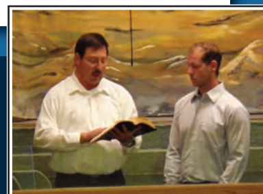
Baptism in Langham, Sask. Church News