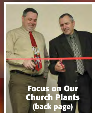
Focus on Our Church Plants (back page)

Welcome to the Fellowship! Compass Immanuel Church, Rapid View, Sask.