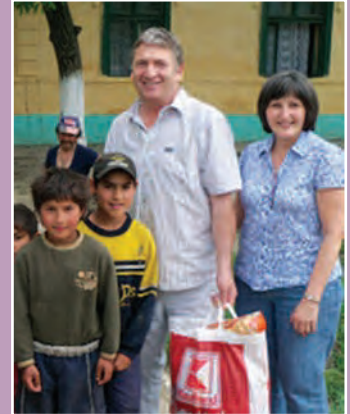
Tabita Ministries Pages 8 & 9