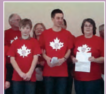
Focus on Our Churches Love Costa Rica Pages 10-14