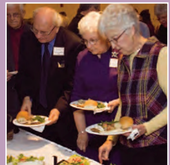
EBC Omaha throws a party! Page 5