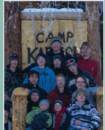
Frozen Together Page 7