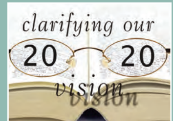
What's Next? Page 3