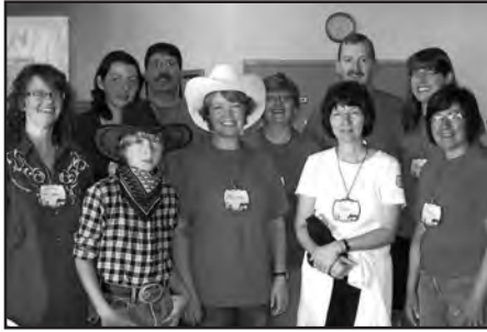
VBS staff prepared for a western theme at "Saddle Ridge Ranch."

Many of our youth impacted children for Christ by working at local Bible camps over the summer. Vacation Bible School was an exciting week at "Saddle Ridge Ranch" for the more than 30 children attending.