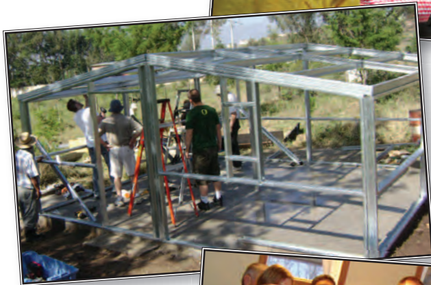
EBC Omaha sends a short-term missions team to Guatemala.