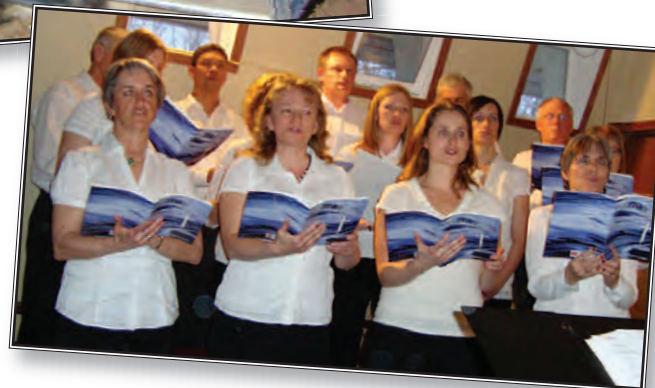
A drama and music production in Stuartburn, Man.

Find out what's happening in other FEBC churches ... see pages 11-14