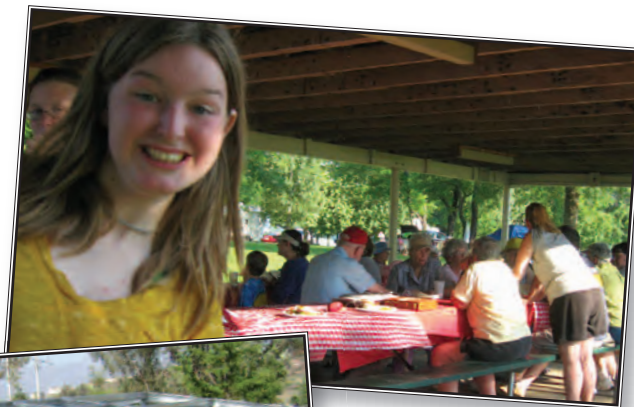
An old-fashioned picnic in Tahlequah, Okla.